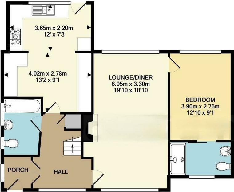
GROUND FLOOR APPROX. FLOOR AREA 71.8 SQ.M. (773 SQ.FT.)

206 South Coast Road, Peacehaven, East Sussex, BN10 8JP 01273 830 987 bnsales@localagent.co.uk